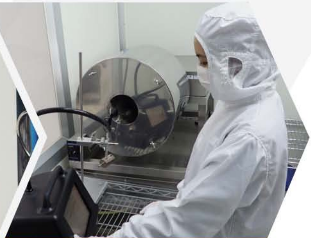
Testing on garment cleanliness