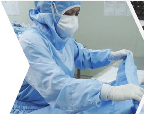
Check rejection criteria